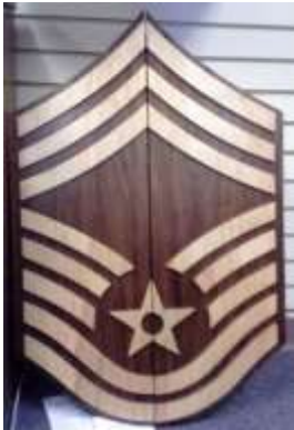
$460.00=Chevron -front door hinged with coin racks inside